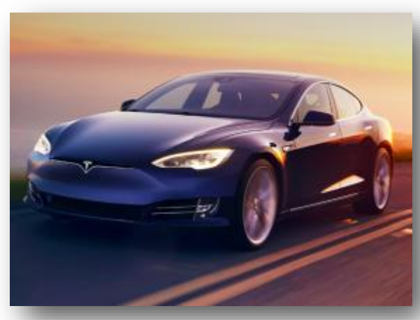
Model S P100DL The World's Quickest Production Car

We continue to expand the Tesla vehicle charging network. At the end of Q3, we had 715 Supercharger locations globally, with 4,461 individual Superchargers. 97% of the population in the continental U.S. and 86% of western Europeans are now within 150 miles of a Supercharger. High population areas in China, Japan and Australia will soon reach similar coverage levels. The Supercharging network is supplemented by 3,222 destination chargers with 5,547 connection points globally at the end of Q3. Destination charging offers convenient charging at hotels, restaurants and shopping centers.